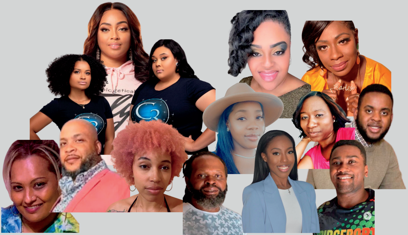
*Photo includes a portion of Bridgeport's SBE certified City-Based Businesses*